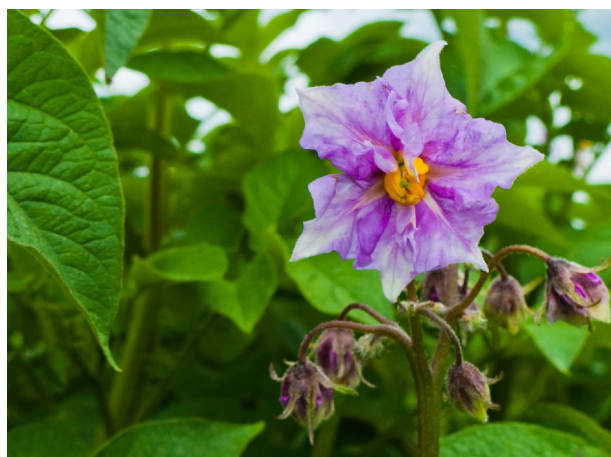
Low N requirement & easy to grow

Valor is an established maincrop proven to be high yielding with a low nitrogen requirement. It produces bold white skinned tubers with good all round cooking qualities. Valor is already popular in the hot dry climates of North Africa and the Middle East, and UK growers seeking an easy to grow white maincrop with supermarket acceptability are finding Valor to be a good choice for prepack markets.