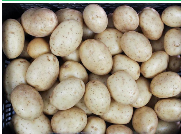
Bold attractive tubers